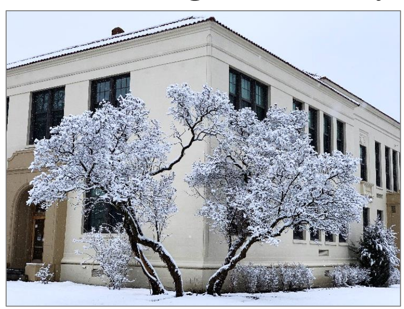
Administrative Professional Employee Handbook